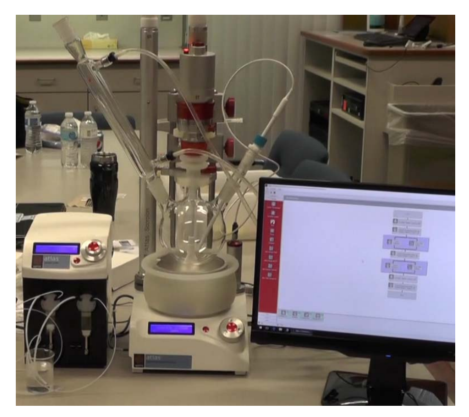
Figure 1. Photograph of Atlas batch chemistry system during training and programming of magnetite core protocol into Atlas software.

Upon receiving this grant, we customized and then purchased batch and flow chemistry systems that maximize our nanoparticle synthesis capabilities, and also have the flexibility to produce components for other regenerative medicine applications. We received the equipment in April 2018, and assembled and trained on the systems in May 2018. We videotaped the training sessions, for use in training other Mayo Clinic research collaborators to use the systems. Our existing protocol for producing magnetite cores was programmed into the Atlas system software for semi-automated production. In addition, we worked with a Dolomite system expert to develop a protocol for that system to coat the magnetite cores with PLGA. We are awaiting delivery of an emulsion stabilizing oil necessary for PLGA coating, and then we can begin nanoparticle synthesis. We are currently working on a marketing plan to share the capabilities of these new systems with other Mayo Clinic researchers, to encourage collaborations that utilize this equipment.